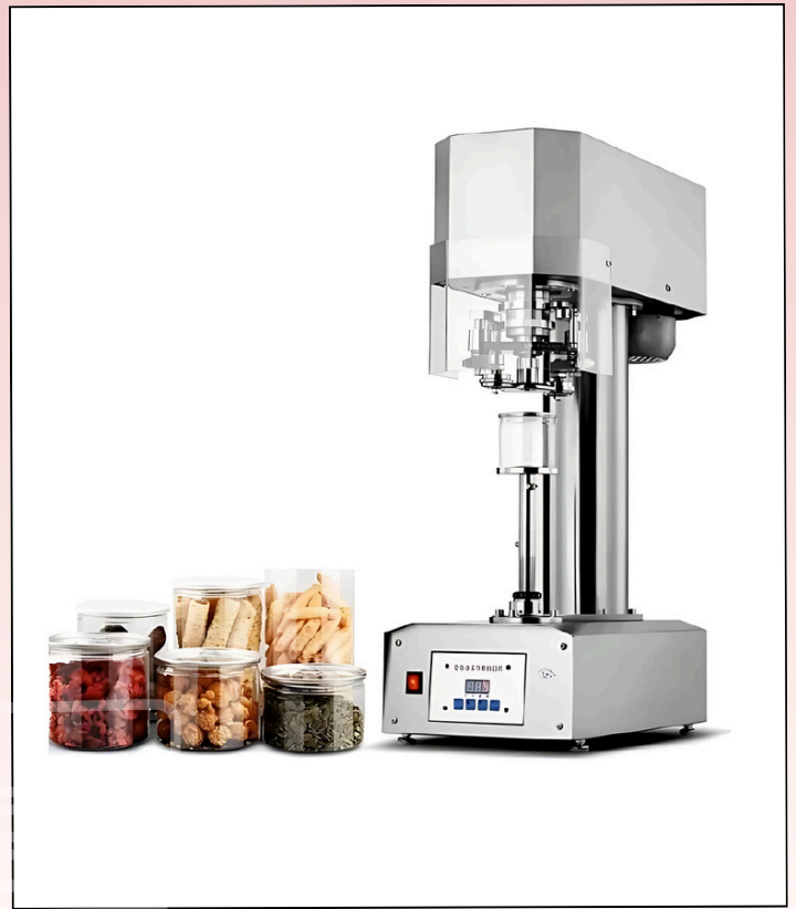
PCSM-102 STAINLESS STEEL BODY