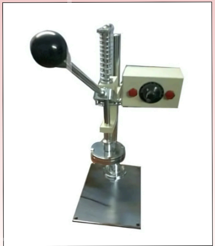
PCSM-104 FOIL SEALING MACHINE

AT SALUJA PET, OUR PET CAN SEAMING MACHINE IS ENGINEERED TO DELIVER UNMATCHED PRECISION AND EFFICIENCY FOR SEALING PET CANS. DESIGNED WITH VERSATILITY AND RELIABILITY IN MIND, IT IS AN ESSENTIAL SOLUTION FOR INDUSTRIES REQUIRING AIRTIGHT PACKAGING TO MAINTAIN PRODUCT QUALITY AND SHELF LIFE.