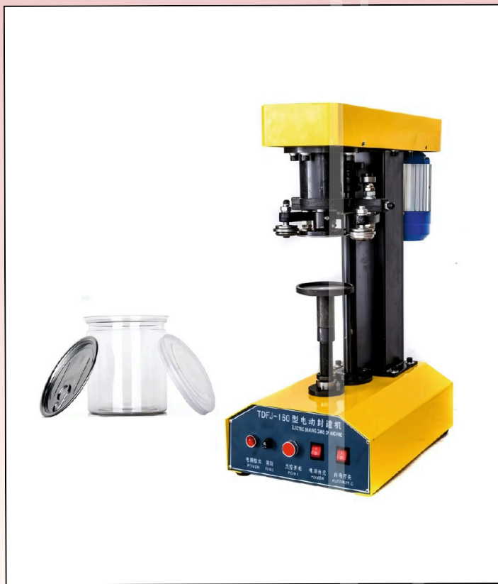
PCSM-103 POWDER COATED BODY