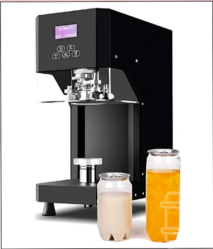
PCSM-101 BEVERAGE MACHINE